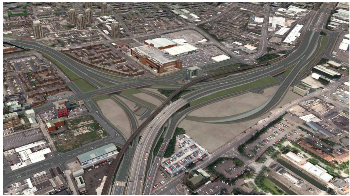
Preferred Option to improve York Street Interchange

Delivery of the York Street Interchange scheme remains a high priority for the Department. This scheme will address a major bottleneck on the strategic road network, replacing the existing signalised junction at York Street with direct links between Westlink, M2 and M3, the three busiest roads in Northern Ireland.